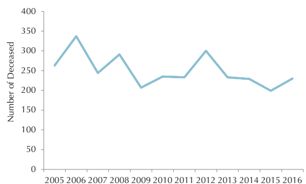
Figure 1. Frequency of the Deceased Population Because of Accidents and Driving Accidents Leading to Death in Chaharmahal and Bakhtiari Province During 2005 to 2016.

rate of accidents has decreased significantly (Spearman's rho = -0.65, P=0.022 ). In terms of the distribution of the months of the year, the highest percentage of accidents belonged to the end of August and the beginning of September while the lowest percentage was related to the end of February and the beginning of March (Figure 2). In addition, the frequency of accidents leading to death indicated a significant change based on the month and the year ( P<0.001 ). Further, the frequency of deaths caused by accidents represented a significant difference when compared based on gender and marital status ( P<0.001 ). Based on the results, the highest frequency of deaths caused by accidents belonged to married men. Furthermore, the frequency of accidents leading to deaths based on age demonstrated a significant difference ( P<0.001 ), in which the highest frequency belonged to the age range of 21-25 while the lowest frequency was related to the age range of 11-15 and 80 and over. The frequency of deaths caused by accidents also had a significant difference when compared based on the level of education ( P<0.001 ). According to the data, the highest frequency was related to illiterate groups whereas the lowest frequency belonged to people with master's degrees and higher (Table 1). As regards the county, most accidents leading to deaths belonged to Shahrekord (58.2%) while the lowest number of accidents